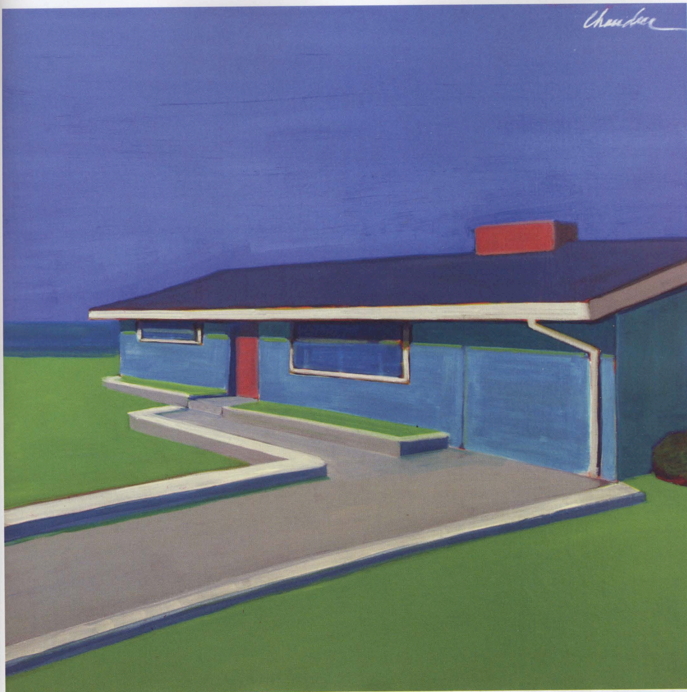
POST MODERN HOUSE WITH OCEAN VIEW, ACRYLIC ON CANVAS, 30 X 30"