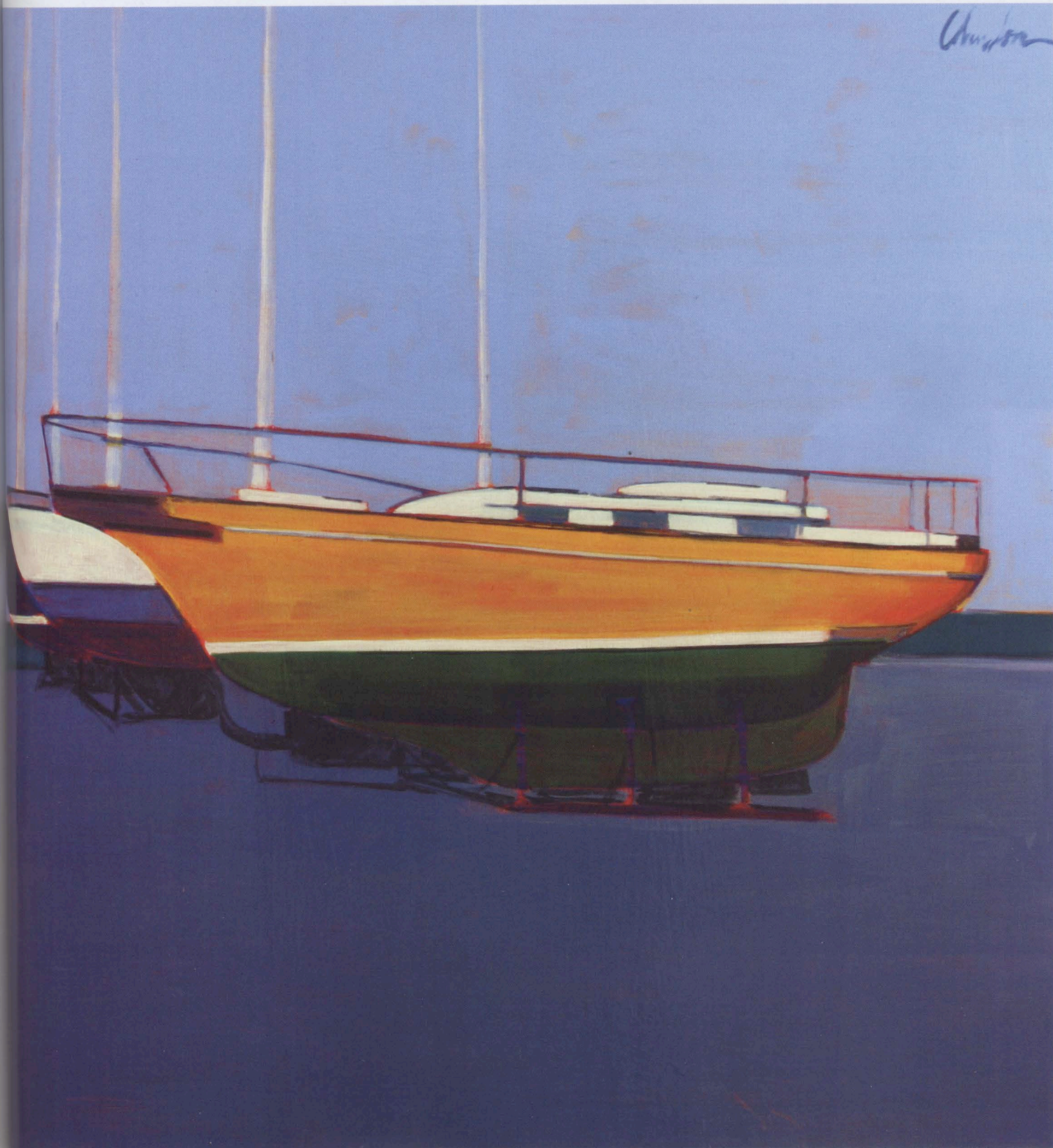
SAIL BOATS IN DRY DOCK, ACRYLIC ON BIRCH PANEL, 36 X 36"