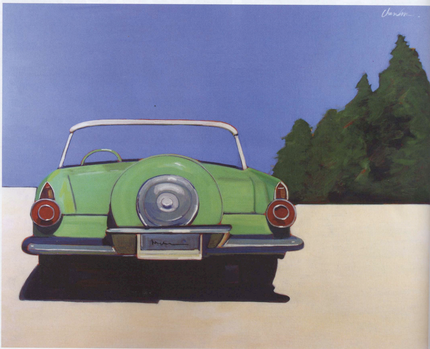
THUNDERBIRD, ACRYLIC ON ORGANIC CANVAS, 48 X 60"