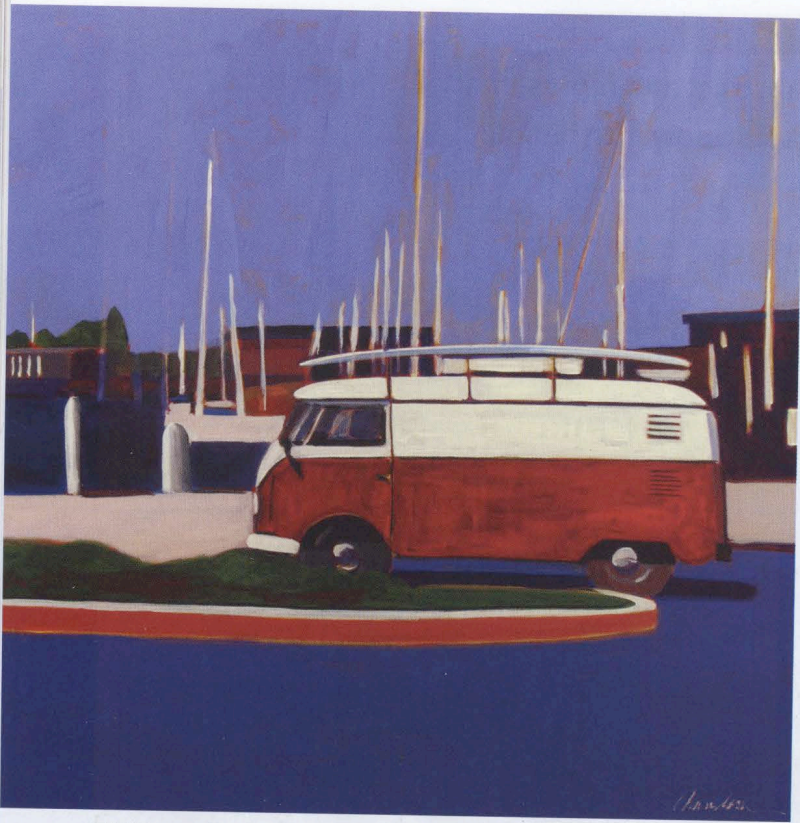
VW BUS IN BERKELEY MARINA, ACRYLIC ON CANVAS, 36 x 36"