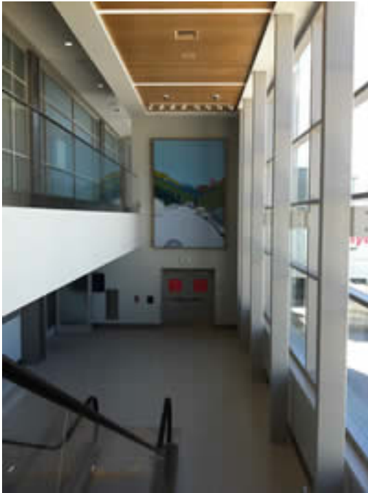
The images above were shot during installation of the painting.