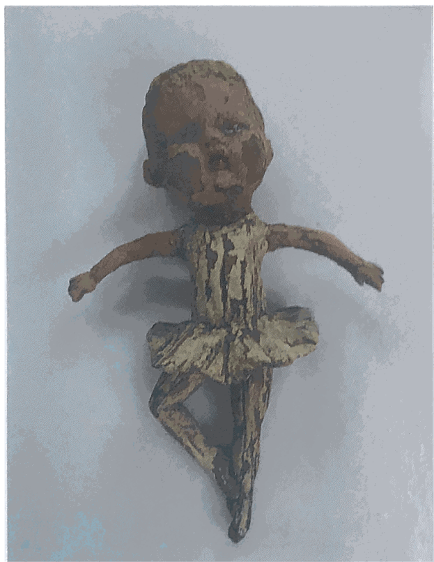
L113 » TINY DANCER C / Margaret Keelan Ceramic / 8 x 4 / $400 / $180