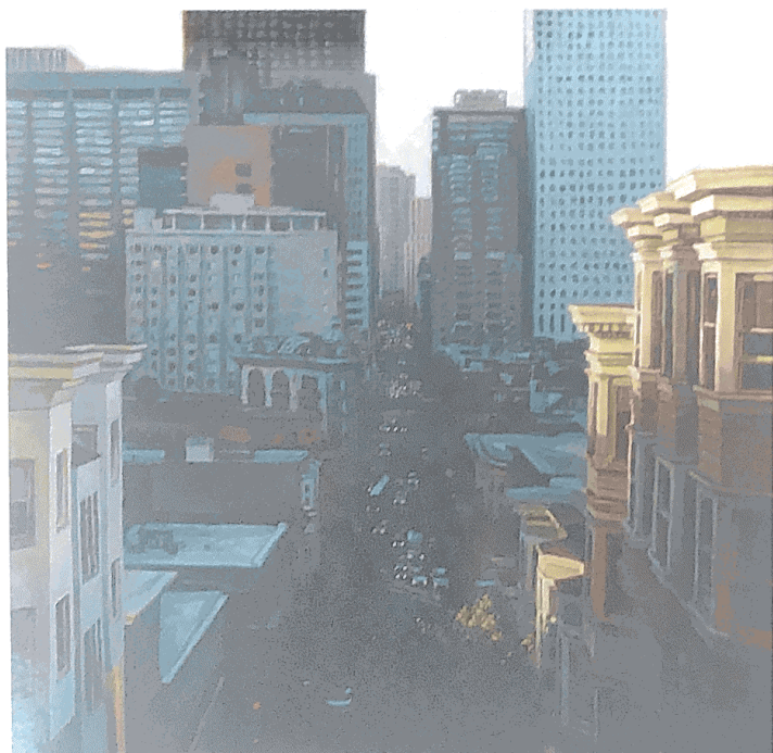
L115 » FIRST LIGHT / Sung Kim Oil on Canvas / 24 x 24 / $2,800 / $900